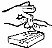
TEST BLOOD SUGAR